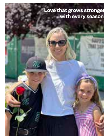
Love that grows stronger with every season.