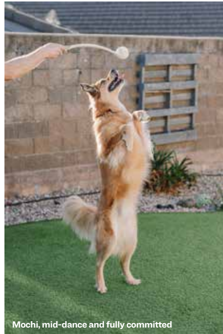
Mochi, mid-dance and fully committed