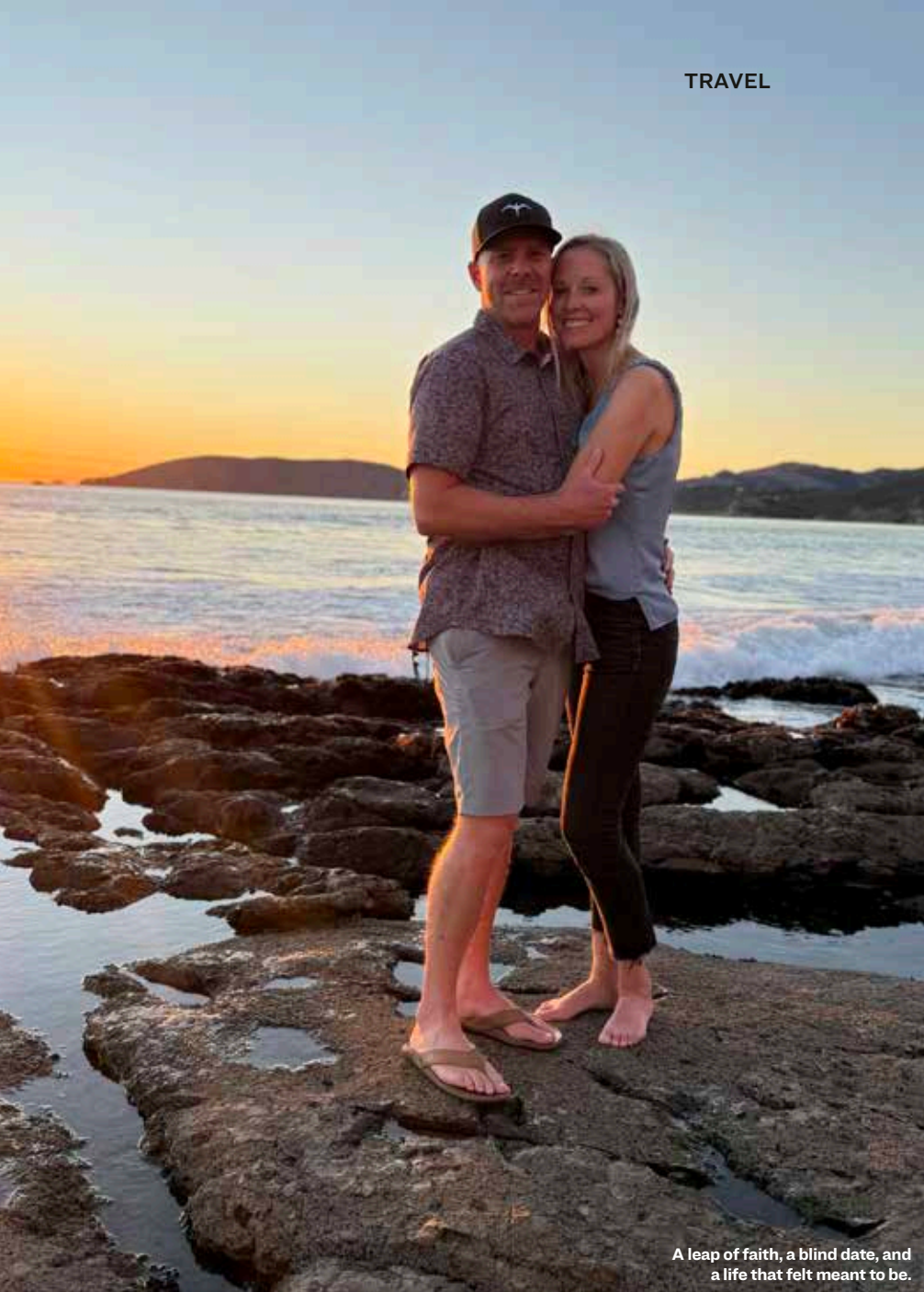
A leap of faith, a blind date, and a life that felt meant to be.