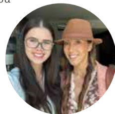
My mom and me.