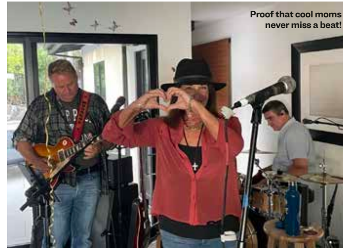
Proof that cool moms never miss a beat!

To learn more, get involved, or support their mission, visit jackshelpinghand.org or email jhh@jackshelpinghand.org