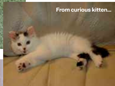
From curious kitten...